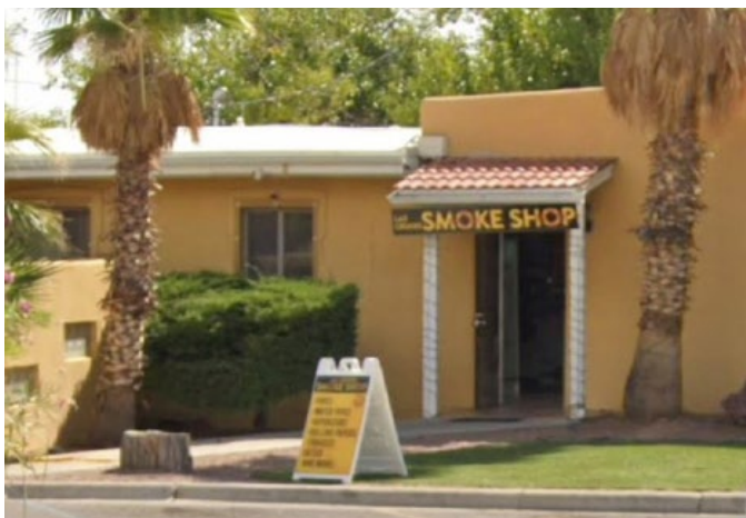
Suite B Entrance