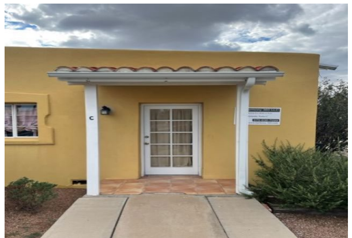
Suite C Entrance

We obtained the information above from sources we believe to be reliable. However, we have not verified its accuracy and make no guarantee, warranty or representation about it. It is submitted subject to the possibility of errors, omissions, change of price, rental or other conditions, prior sale, lease or financing, or withdrawal without notice. We include projections, opinions, assumptions or estimates for example only, and they may not represent current or future performance of the property. You and your tax and legal advisors should conduct your own investigation of the property and transaction.