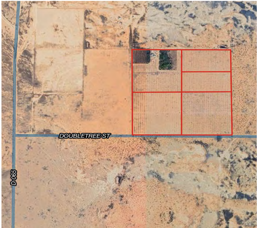
Total of Five (5) Lots