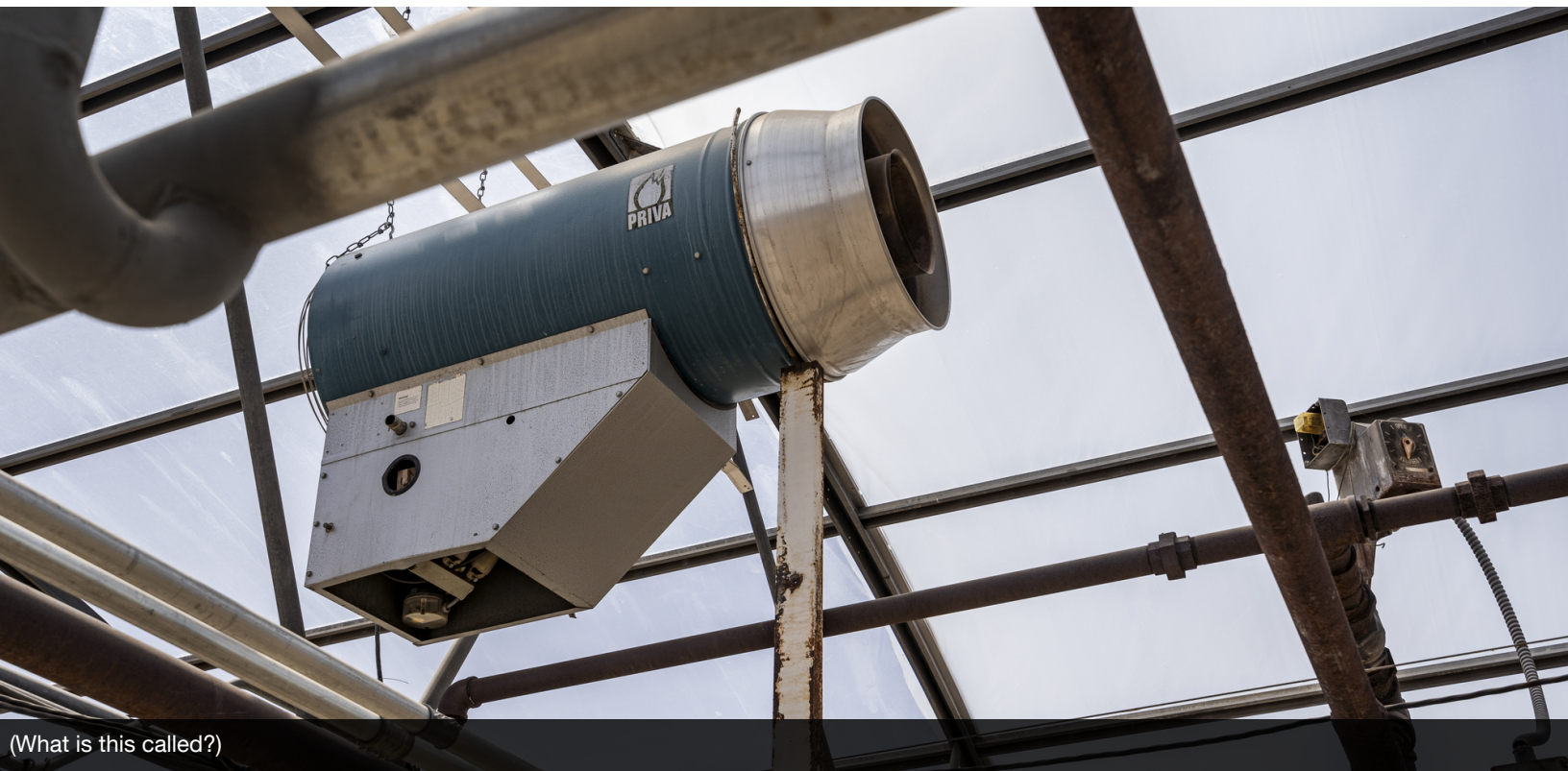
(What is this called?)