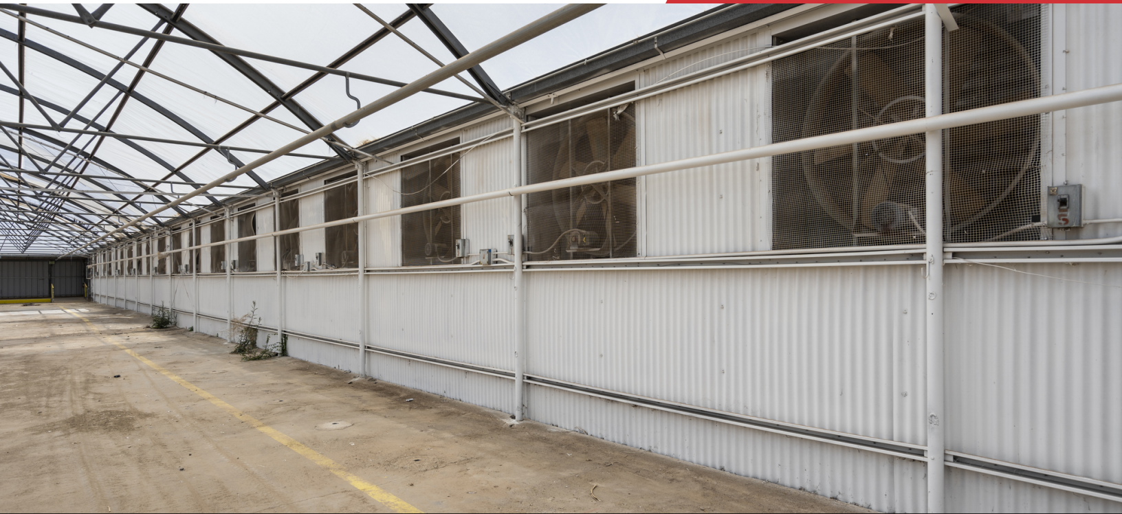
Large Commercial Exhaust Fans