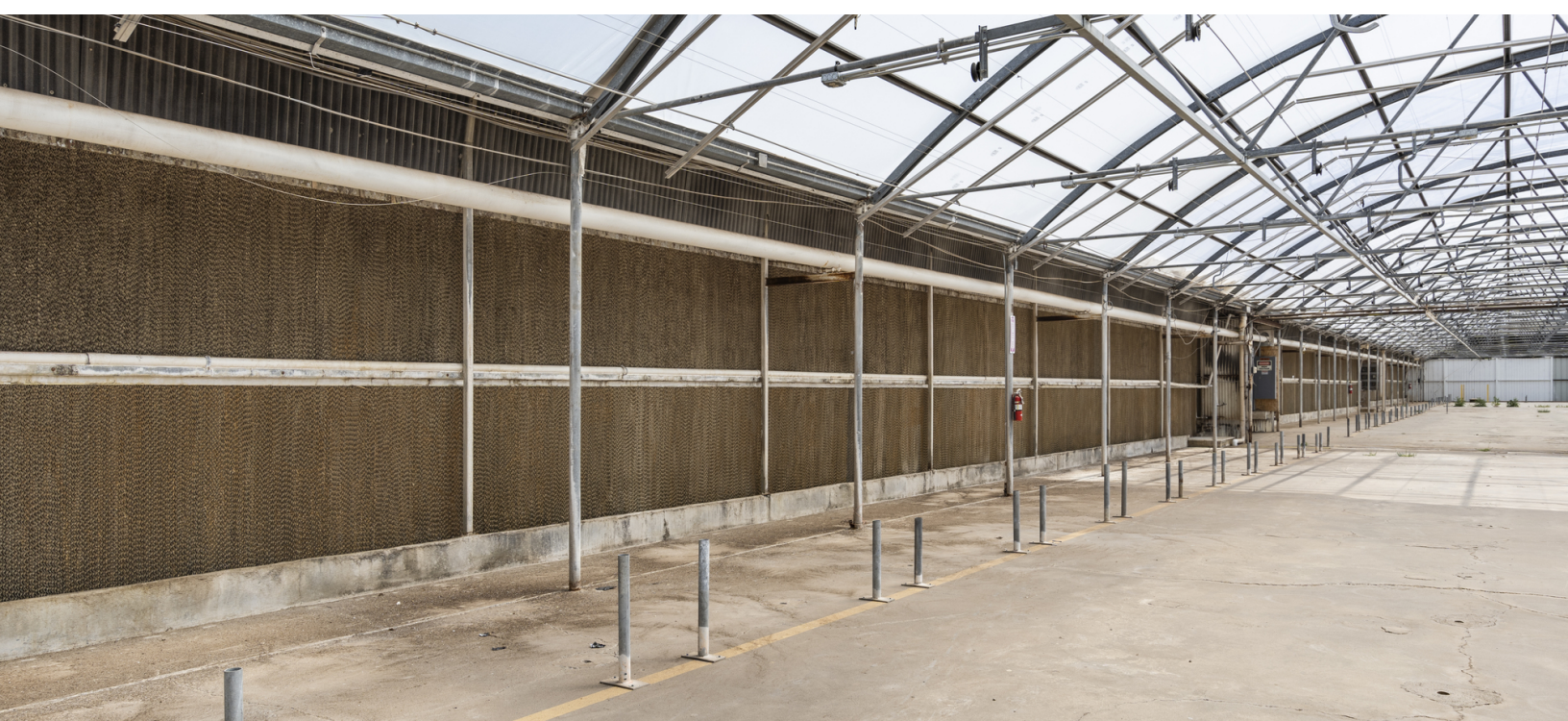
Two Tier Evaporative Cooling Walls

We obtained the information above from sources we believe to be reliable. However, we have not verified its accuracy and make no guarantee, warranty or representation about it. It is submitted subject to the possibility of errors, omissions, change of price, rental or other conditions, prior sale, lease or financing, or withdrawal without notice. We include projections, opinions, assumptions or estimates for example only, and they may not represent current or future performance of the property. You and your tax and legal advisors should conduct your own investigation of the property and transaction.