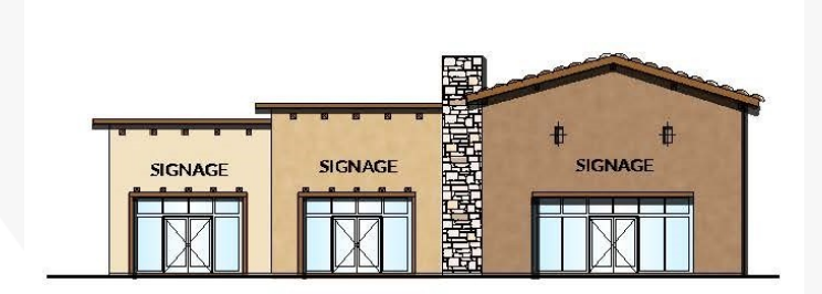
FRONT ELEVATION (FACING PARKING LOT)