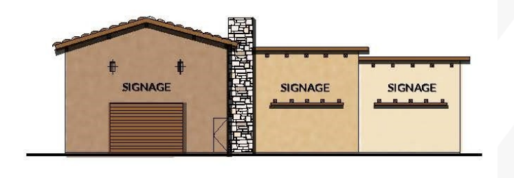
BACK ELEVATION (FACING EMERALD ST.)